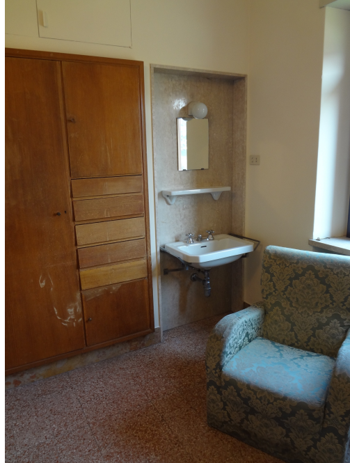
(b) Room sink and wardrobe