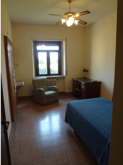
(a) Looking towards the window