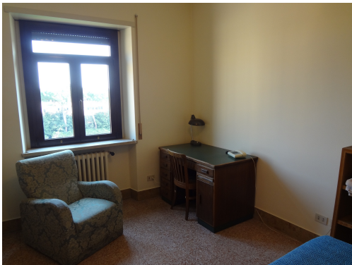
(c) The window and some furniture