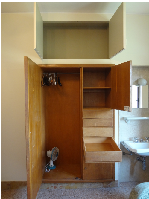
(e) Wardrobe and overhead storage