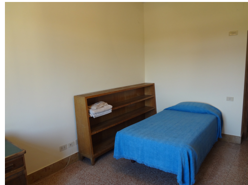
(d) The bed and bookshelf