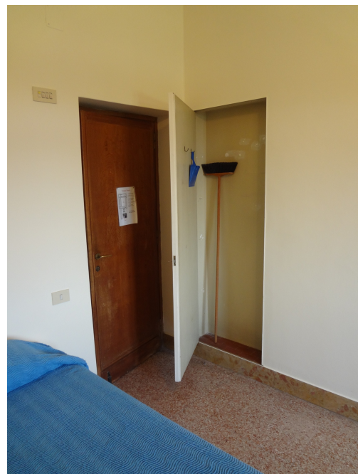
(f) Broom closet and door